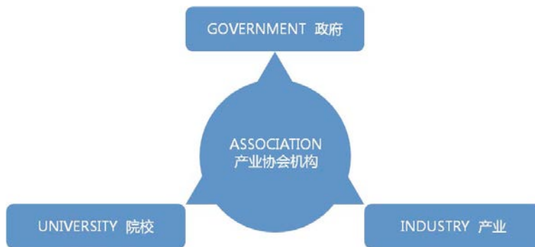
Figure 1-A-UIG Model

A-UIG model stands for the “university-industry-government” model with association as its core. Under this model, we should first define the role of each part: “university” refers to design colleges; “industry” refers to enterprises with design needs; “government” refers to industrial sectors in the government; “association” refers to design associations or industrial organizations, different in both nature and function from the “research” in the traditional model and the most fundamental is to reposition according to the content, form and approach of modern design industry. (Figure 1: A-UIG Model)