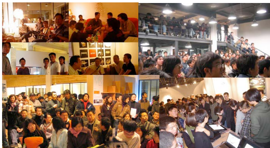
Figure 2-activities in Shanghai Industrial Design

Shanghai Industrial Design has planned and organized a series of activities since it is established (figure 2), such as the “Designers’ Night—the inaugural meeting of Shanghai Industrial Design” held in September 2005, the “Sketching Night” held in the Shanghai design factory in May 2006, the press conference of the new book Industrial Design by Shanghai Industrial Design in 2007, Beijing International Industrial Design Expo in September 2007 as a co-organizer, etc. All of these activities aim to continuously integrate design resources and build a design context as well as mechanism of exchanges and dialogues. Driven by design organizations, government, enterprises and universities are able to jointly witness the development of design from various ways and perspectives and get involved in active participation and perfect integration.