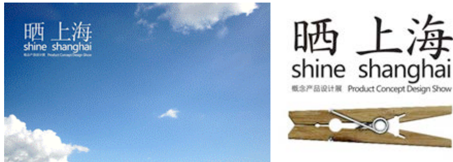
Figure 4-Poster of Shine Shanghai Product Concept Design Show

doing so, we can make the design industry widely understood and recognized by the society and lay a foundation for making China's industrial policies in terms of design education, research in value, commercial considerations, talent construction, etc.