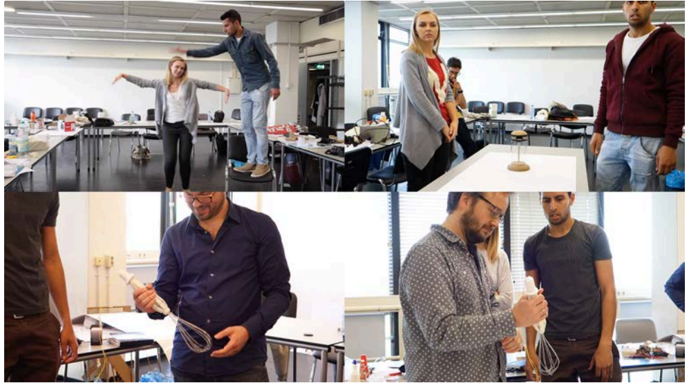
Figure 5 –Session 3, redesign with shape-changing technology.

reimagined to change its shape, depending on the progress of whipping action (Figure 5). Overall, the bodily movement exploration provided an experiential and embodied facilitation, while the descriptions on the cards guided them to identify crucial elements of perceptual qualities within the exploration.