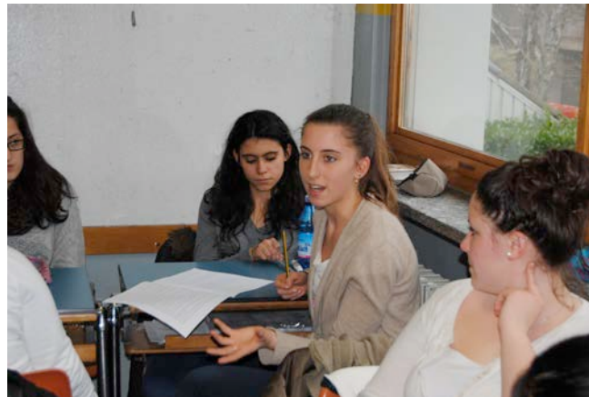
Figure 5 – Call for actions: the proposal of actions to contrast the problem.

The goal of the Call for Action was a moment of shared reflection on issues relating to gender stereotypes expressed by the media, the sharing of what is related to "the media and culture" that are part of the European Parliament's motion for a Resolution of the European Union in 2012. Among the proposals of the students has been predominantly declared the need to enrich the education on these issues in learning contexts.