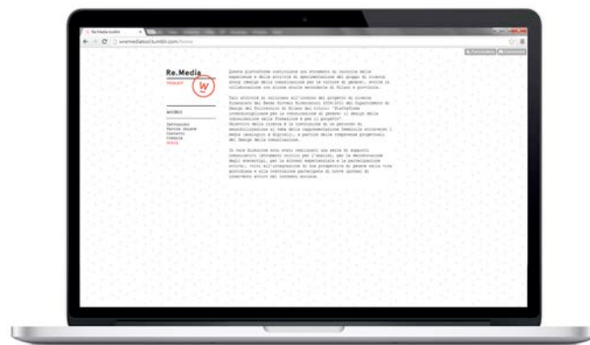
Figure 3 –The digital platform for the visual diary.

Some "hashtags" (the adjectives associated with the images), also reflect the verbal language and the recurrent stereotyped definitions most of which demeaning the subject represented. This emphasizes the importance of the need to operate in education on the double register of visual and verbal language, students must be enriched with tools that make them able to think and express themselves over any prejudices or cliché.