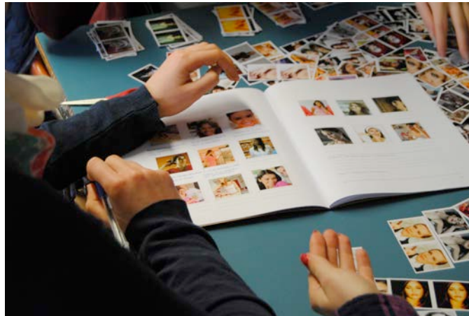
Figure 2 –The album with stickers.

The work on the album closes with the drafting of a double page of synthesis where for every stereotype identified is indicated a representative image.