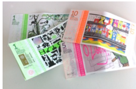
Figure 2. The Bristol Pound Notes

http://www.oisebristol.me/2012/09/25/by-virtue-and-industry/bristol-pound/