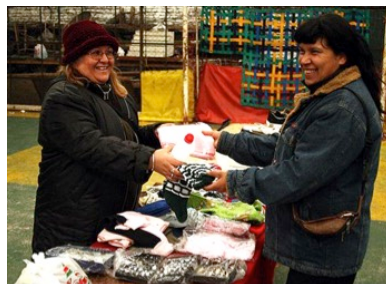
Figure 7. Red Global de Trueque, Argentina http://www.lanacion.com.ar

The case studies illustrated that due to the nature and/or main causes of the global crisis in the different contexts in which it has emerged, it is clearly difficult to transnationally replicate an existing model into another context. One key question is what is the specific need that the application of a new complementary value creation system should fulfil? We can see that in the developed contexts, such as with the cases of 'Bristol', U.K., 'Sardex', Italy and 'WAT', Japan, all demonstrate a need for economic benefit, local and/or individual empowerment, enhancing collaboration and using existing local resources. Cases such as 'Palmas Bank', Brazil, 'Bangla-Pesa', Kenya and "Grameen Bank", Bangladesh all show the need for financial inclusion, building stronger community ties, trust and capacity building.