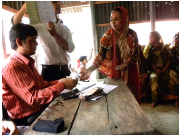
Figure 5. Grameen Bank borrowers attend a weekly center meeting to make loan repayments